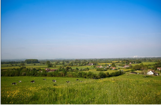
Hill8

Students at Manorbrook Primary School wrote persuasive pieces about conservation, their local area and why you should buy local produce. Year 5 students in Thornbury completed a persuasive writing project in which they researched, interviewed and developed their writing skills before having their writing published on the Forgotten Landscape Website.